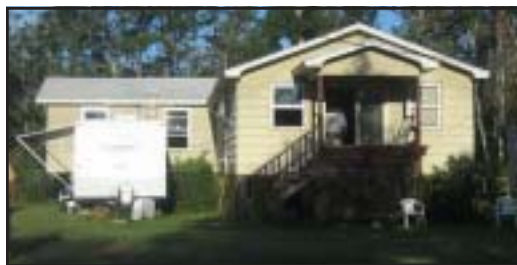
Photo above shows outside of home built on stilts and FEMA trailer, middle photo shows damage of home, and bottom photo shows team with homeowner, all from September, 2006, trip.